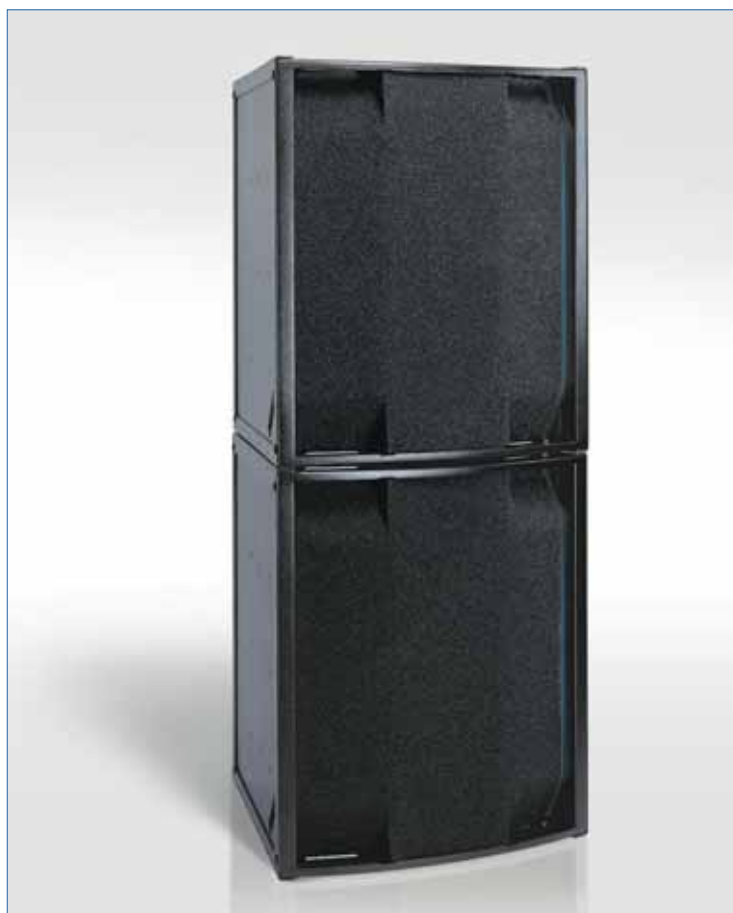
APG 9000 System : 9000HI and 9000LO speakers

The APG Matrix Array technology includes the APG4000, APG6000 and the APG9000 systems.